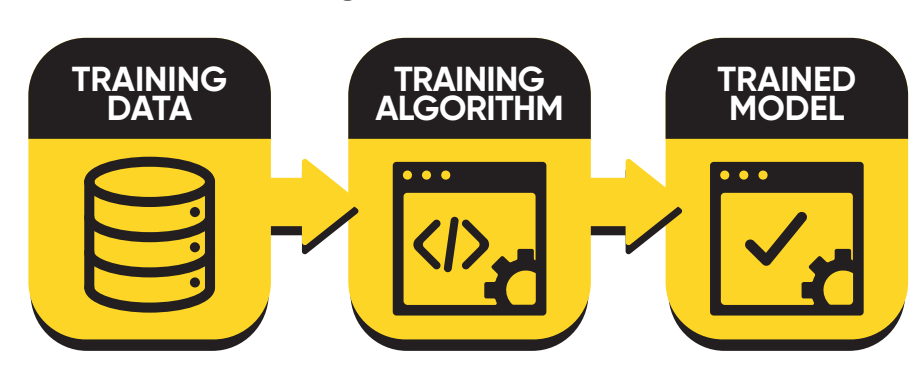
Figure 1– TRAINING PROCESS